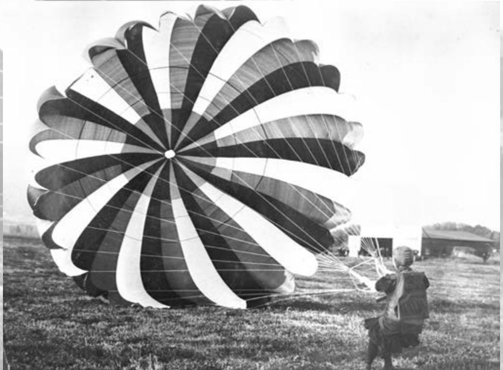
Tiny Broadwick, landing at Griffith Park, Los Angeles, California, picture is an action shot and was a stand up landing.

Tiny Broadwick died at age 85 on August 25, 1978 in California. She was returned to Henderson North Carolina for burial in the Sunset Gardens Cemetery.