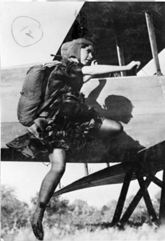
Tiny Broadwick jumping from an airplane.

In 1914, representatives of the Army Air Corps visited her in San Diego and asked her to demonstrate a jump from a military plane. War was already raging in Europe. Many pilots of the corps had perished, and more would surely follow if nothing was done to help them. Tiny made four jumps at San Diego's North Island that day. The first three went smoothly, but on the fourth jump, her parachute's line became tangled in the plane's tail assembly. The wind flipped her small body back and forth, and she could not get back into the plane. Tiny Broadwick did not panic. Instead, she cut all but a short length of the line and plummeted away toward the ground. Pulling the line by hand, she freed the parachute to open. She demonstrated what would be known as the rip cord. Her quick thinking and coolness under pressure made Tiny Broadwick the first person ever to make a planned free-fall descent. The mid-air accident she survived demonstrated that a person leaving an airplane in flight did not need a line attached to the aircraft in order to open a parachute. A pilot could safely bail out of a damaged craft. The parachute became known as the life preserver of the air. During World War I, Tiny served as an advisor to the Army Air Corps.