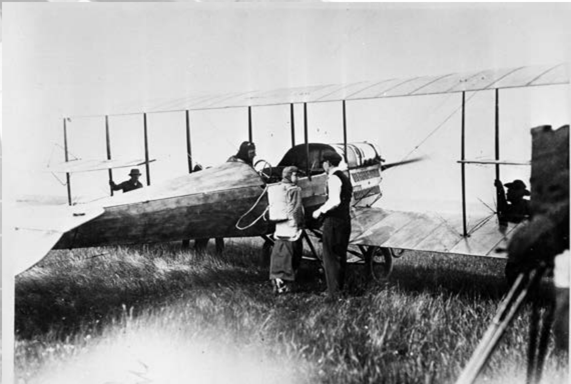
Tiny Broadwick wearing parachute coat, man standing next to her is Charles Broadwick, North Island, San Diego, California.

In 1914, representatives of the Army Air Corps visited her in San Diego and asked her to demonstrate a jump from a military plane. War was already raging in Europe. Many pilots of the corps had perished, and more would surely follow if nothing was done to help them. Tiny made four jumps at San Diego's North Island that day. The first three went smoothly, but on the fourth jump, her parachute's line became tangled in the plane's tail assembly. The wind flipped her small body back and forth, and she could not get back into the plane. Tiny Broadwick did not panic. Instead, she cut all but a short length of the line and plummeted away toward the ground. Pulling the line by hand, she freed the parachute to open. She demonstrated what would be known as the rip cord. Her quick thinking and coolness under pressure made Tiny Broadwick the first person ever to make a planned free-fall descent. The mid-air accident she survived demonstrated that a person leaving an airplane in flight did not need a line attached to the aircraft in order to open a parachute. A pilot could safely bail out of a damaged craft. The parachute became known as the life preserver of the air. During World War I, Tiny served as an advisor to the Army Air Corps.