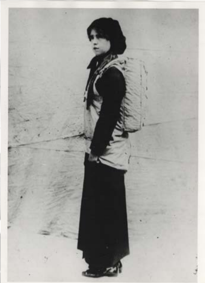
Tiny Broadwick wearing the parachute, now in the Smithsonian Institute, showing the one of a kind dress she jumped in, 1913.

T iny Broadwick made more than 1,000 jumps from airplanes and balloons, enduring and surviving several harrowing mishaps. She ended up on top of the caboose of a train that was just leaving a station; she got tangled up in the vanes of a windmill and in high-tension wires. She suffered numerous injuries along the way – broken bones, sprained ankles and a wrenched back. Broadwick loved her work and looked back on those days with great fondness in her later years. In 1912 Tiny Broadwick married Andrew Olsen but the marriage did not work. During this time she continued to do exhibition jumping in California. She married Harry Brown in 1916. He did not approve of her parachuting and left her in 1920.