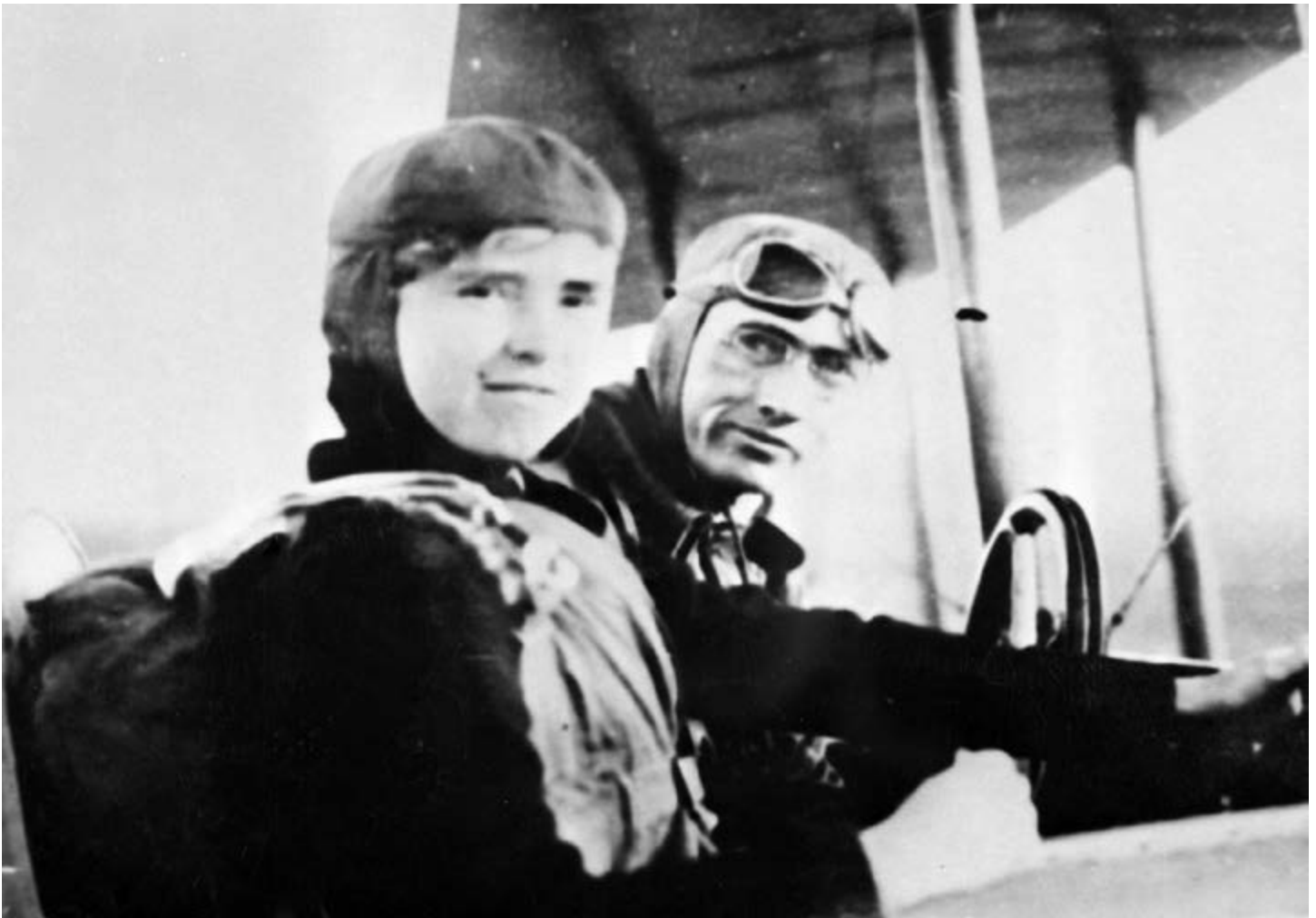
Glenn L. Martin and Tiny Broadwick