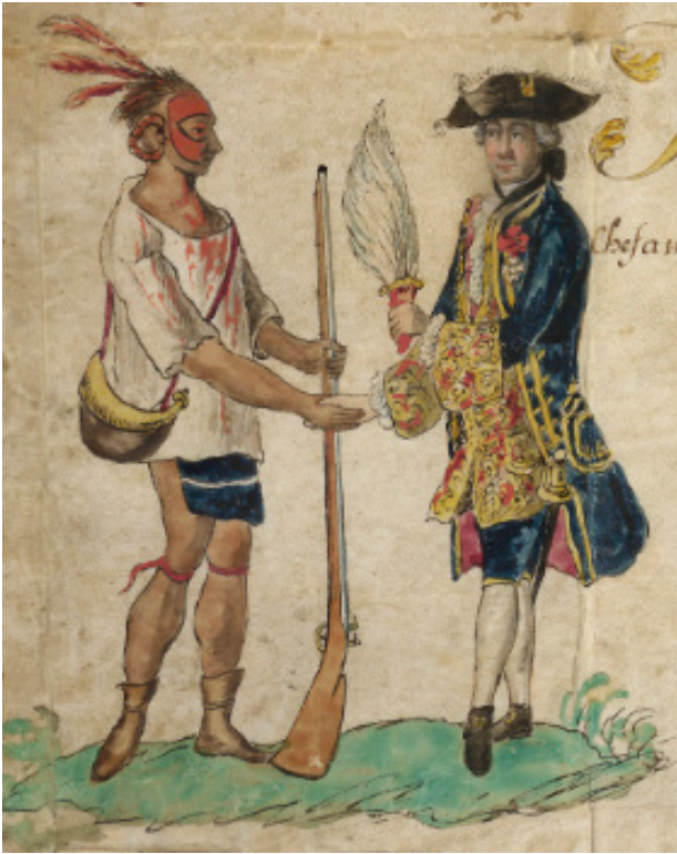
Details of Military Commission Granted to Chief Okana-Stoté of the Cherokee by Governor Louis Billouart, Chevalier de Kerlérec, 1761, National Archives collection 6924937.

In addition to five of the men who negotiated the treaty (introduced in the Reader's Theater Script) three other men had notable roles at the event.