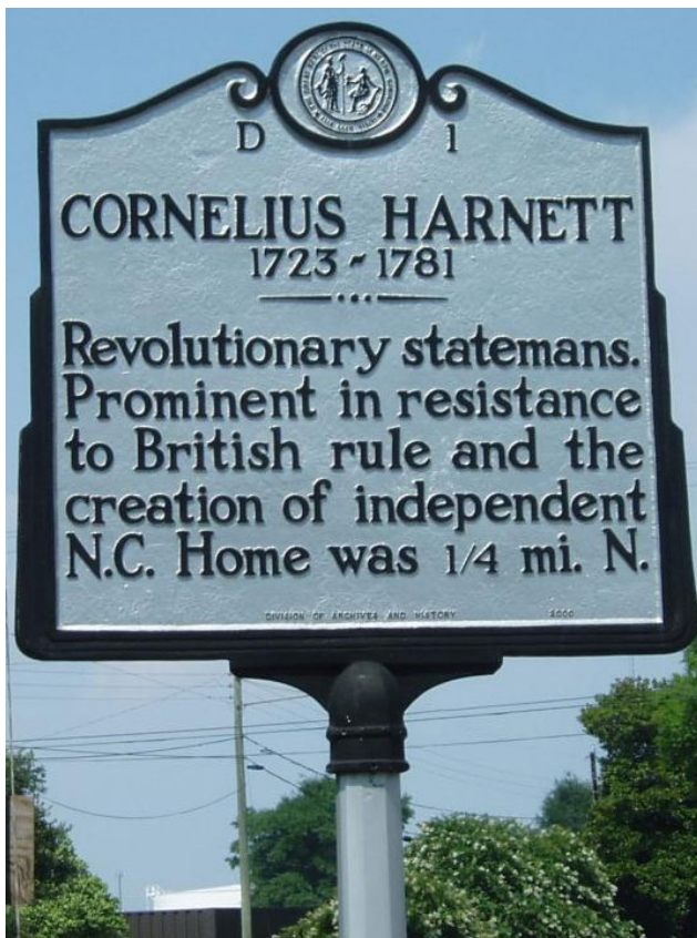
Cornelius Harnett marker, U.S. Highway 117 (Cornelius Harnett Drive) at Jel Wade Drive, Wilmington, New Hanover County.

Extra challenge: historical highway markers have 15-20 words; can you be as brief?