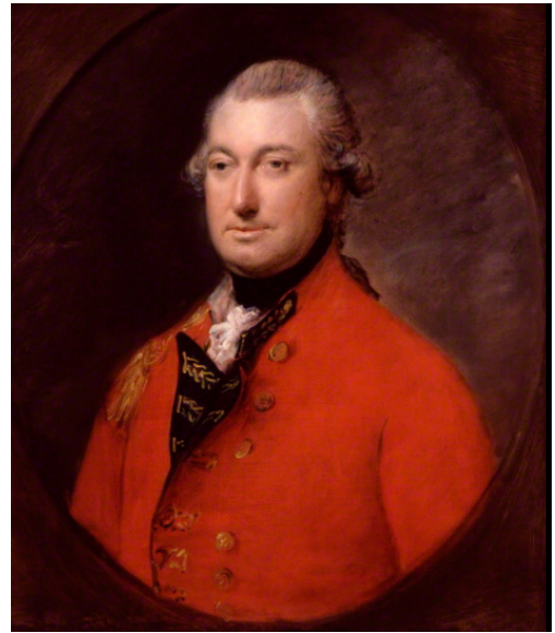
Lt. General Lord Charles Cornwallis, 1783, by Thomas Gainsborough, NPG 281, National Portrait Gallery