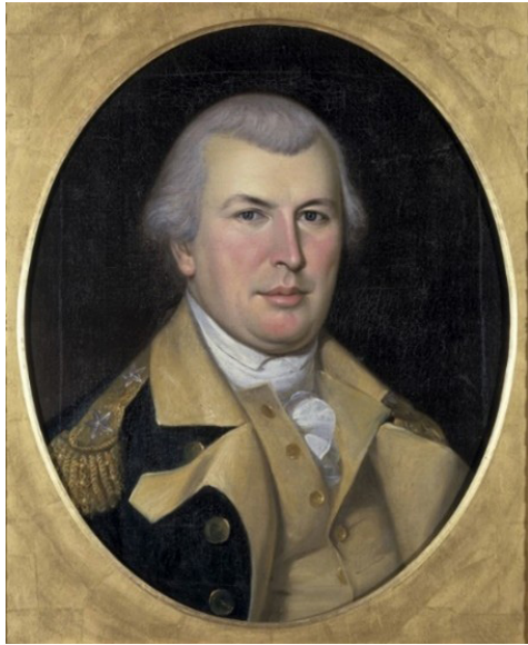
Major General Nathanael Greene, 1783, by Charles Wilson Peale, Independence National Military Park