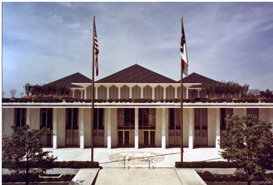
N.C. State House, 1973, T.73.2.1

The State House, completed in 1963, became the center for the legislative branch's activities, including drafting a new constitution in 1970.