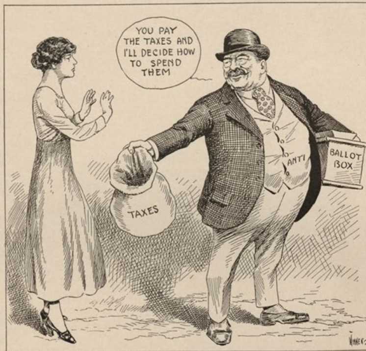
Political cartoon, c. 1920, Equal Suffrage Amendment collection, PC.1618, State Archives of N.C.