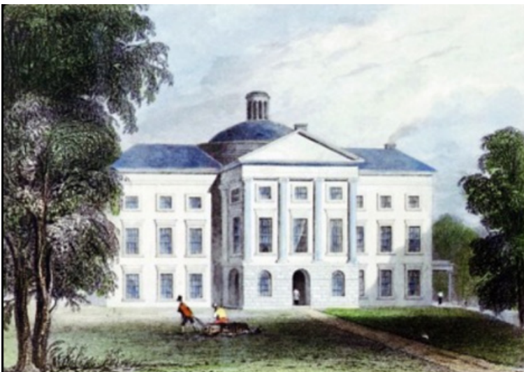
First State House after addition, 1820s-1831, colored drawing by William Goodacre, State Capitol collection

When the delegates assembled in Raleigh for the constitutional convention of 1835, a new capitol building was under construction? Raleigh was established as the capitol city in 1792, and the first state house was built four years later in 1796. The building was then remodeled in the 1820s before being destroyed by a fire in 1831.