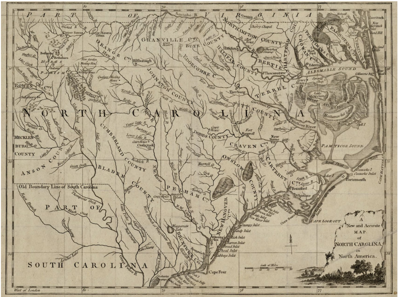
"A New and Accurate Map of North Carolina in North America," (London: J. Hinton, 1779), MC.150.1779a

During the early years of statehood, governors lived in their own houses and the General Assembly moved from place to place, meeting in private residences and in courthouses when available. The 3 rd section of the 1776 constitution provided for two representatives from each county in the House of Commons. Six counties with the largest towns could send an additional representative to the Assembly.