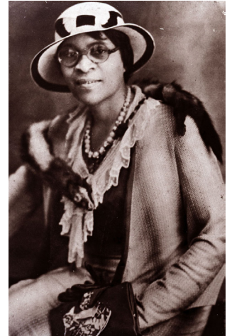
Charlotte Hawkins Brown, Palmer Institute, Sedalia, N.C.