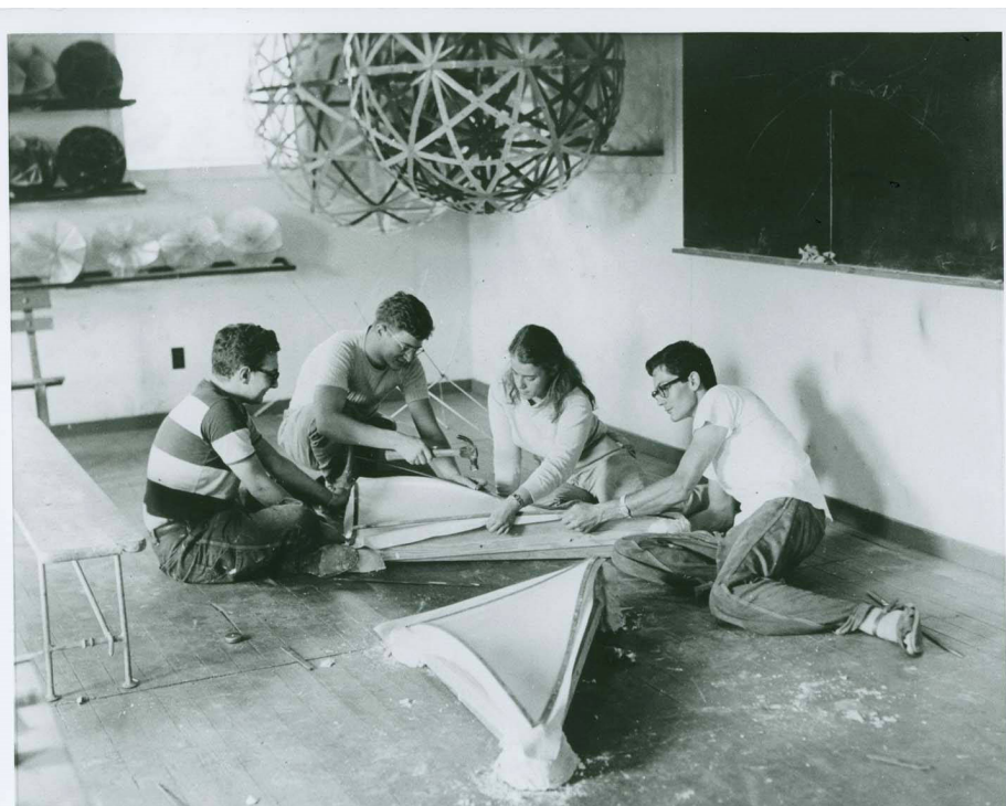
Buckminster Fuller's Architecture class, 1949 Summer Institute, Black Mountain College.