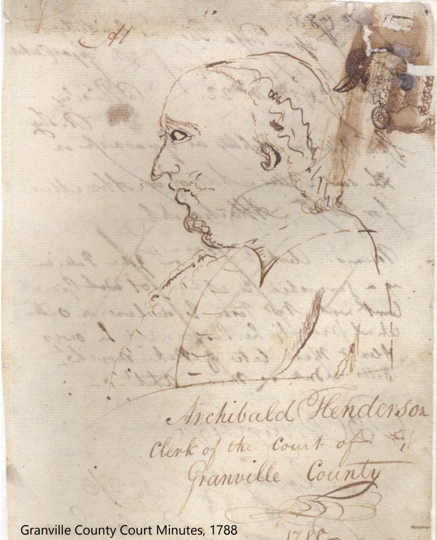
Granville County Court Minutes, 1788